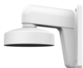
DS-1272ZJ-110-TRS Wall Mounting Bracket