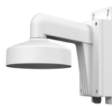
Wall mount + junction box DS-1272ZJ-110B