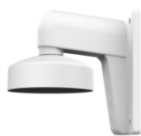
Wall mount DS-1272ZJ-110