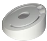
Inclined ceiling mount DS-1259ZJ