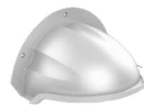
Rain-proof cap DS-1250ZJ