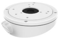
DS-1281ZJ-S Inclined Base Mounting Bracket