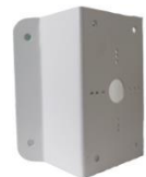
DS-1276ZJ Corner Mounting Bracket