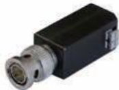
DS-1H18 Video Balun