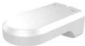
HIA-B404-PT Wall Mounting Bracket